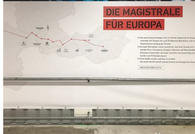
Main Line for Europe initiative